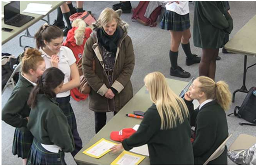
An example of a TOK exhibition event