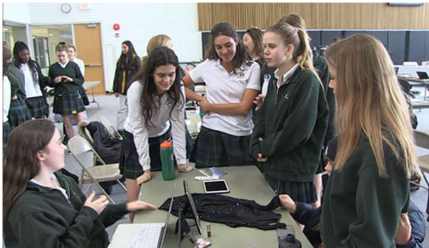
An example of a TOK exhibition event